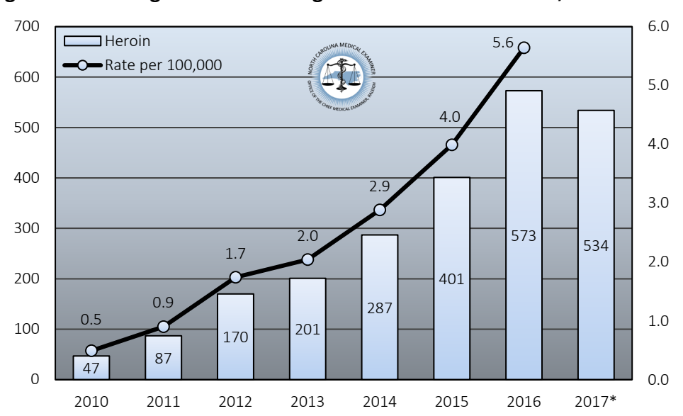
Figure 1 Poisoning Deaths Involving Heroin in North Carolina, 2010 – 2017*

Deaths involving heroin increased by 1119.1% from 2010 to 2016. It is important to note that the NC OCME Toxicology Laboratory revised testing procedures for heroin in 2017, providing a more accurate representation of the involvement of this drug in poisoning deaths.