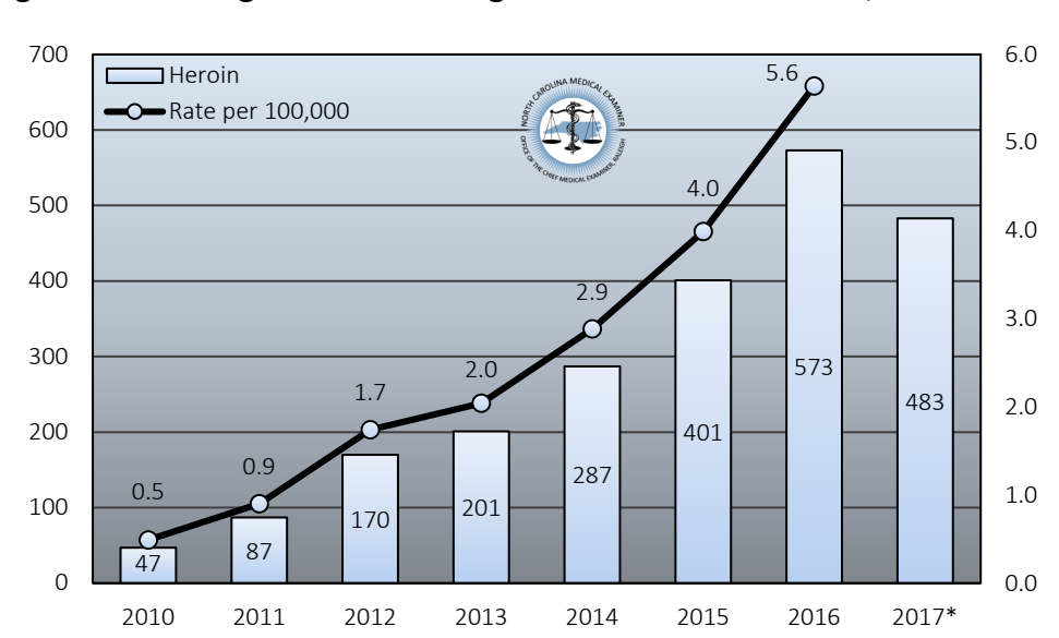
Figure 1 Poisoning Deaths Involving Heroin in North Carolina, 2010 – 2017*

Deaths involving heroin increased by 1119.1% from 2010 to 2016. It is important to note that the NC OCME Toxicology Laboratory revised testing procedures for heroin in 2017, providing a more accurate representation of the involvement of this drug in poisoning deaths.